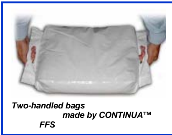
Two-handled bags made by CONTINUA™ FFS