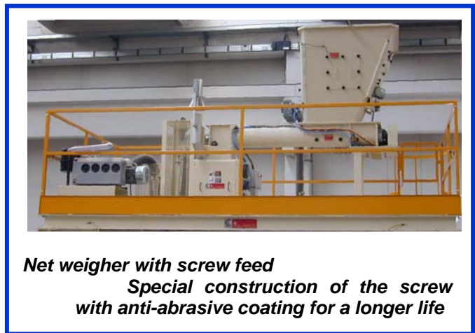
Net weigher with screw feed Special construction of the screw with anti-abrasive coating for a longer life